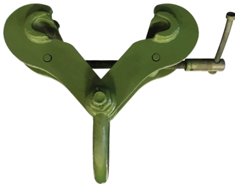
Riley 11,200LB Superclamp S6

Green shading reflects rental inventory.