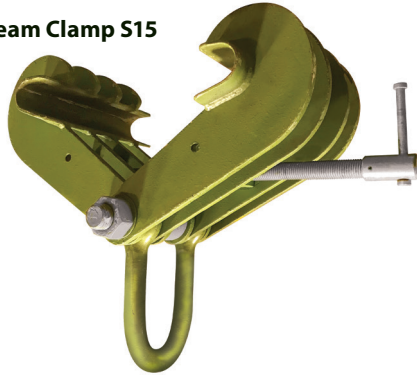
Riley 44,800 Beam Clamp S15